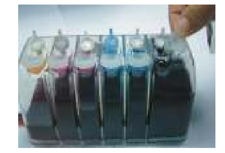
Fig. 5-1 Fig. 5-2